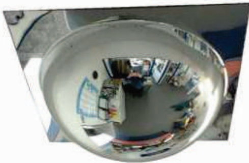
DROP-IN CEILING DOME